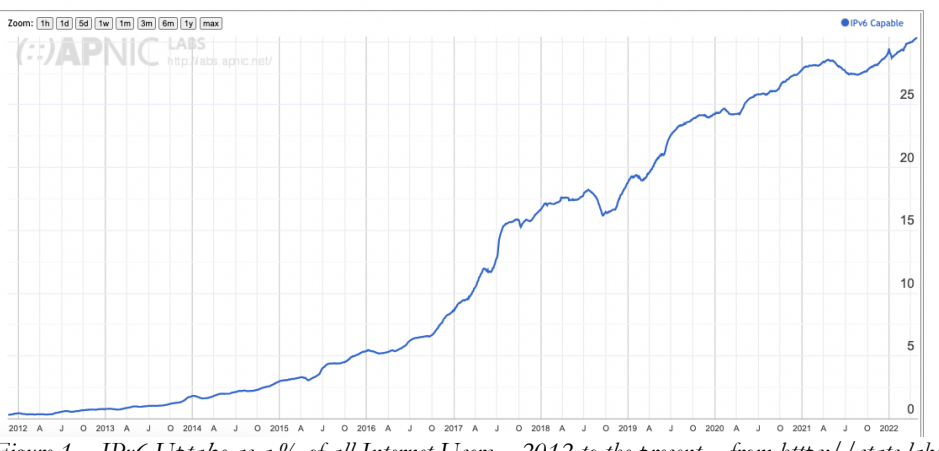
Figure 1 – IPv6 Uptake as a % of all Internet Users – 2012 to the present – from https://stats.labs.apnic.net/ipv6/XA

At first these were faltering steps, but over the past decade the transition has gathered momentum. A plot of the estimated share of IPv6 users who can access IPv6 services is shown in Figure 1.