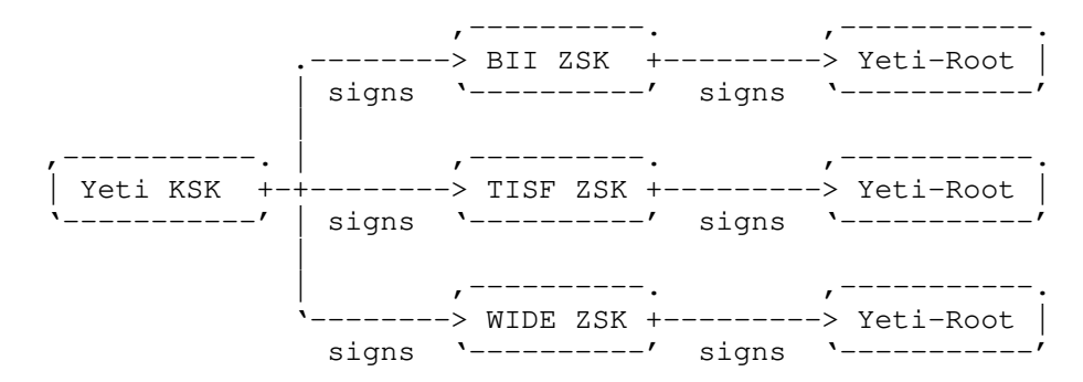
Figure 3: Unique ZSK per DM

part of its own dedicated ZSK key pairs to be available locally, and no other secret key material is shared. The high-level approach is illustrated in Figure 3.